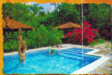
Charming family hotels.