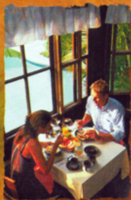
Good food and atmosphere.