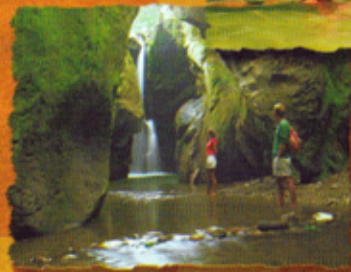
El Rubí waterfall.