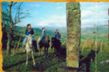
Stele 12, "La Pintada".